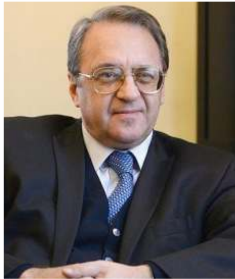
Mikhail Bogdanov Deputy Minister of foreign affairs