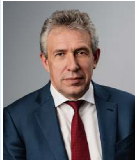
Sergey Gorkov Chairman Vnesheconombank