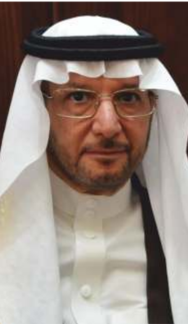
H.E. Dr. Yousef bin Ahmad Al-Othaimeen Secretary General of OIC