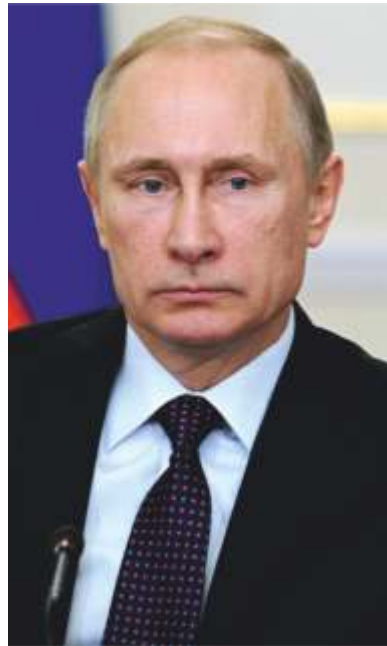
Vladimir Putin President of the Russian Federation

"Kazan Summit is an important venue which allows to create business, to interact with prospective investors, to give a new opportunity either for yourself or for your organization."