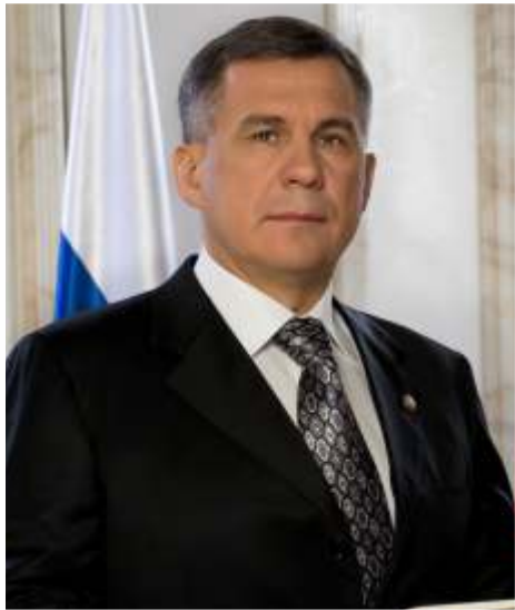
Rustam Minnikhanov President Republic of Tatarstan