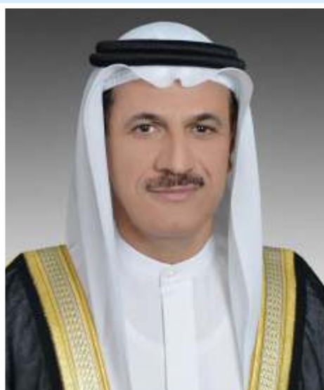
Sultan bin Saeed Al Mansouri Minister of Economy of the United Arab Emirates