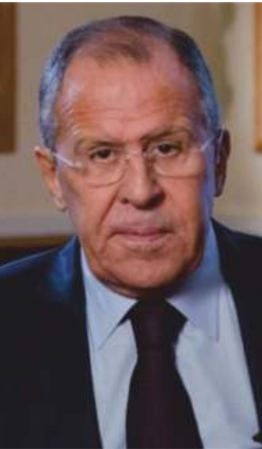
Sergey Lavrov Foreign Minister of Russia