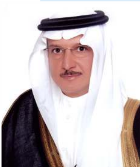
Yusuf Al-Othaimeen Secretary General Organization of Islamic Cooperation