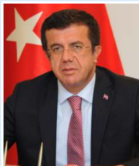
Nihat Zeybekci Minister of the Economy of the Republic of Turkey