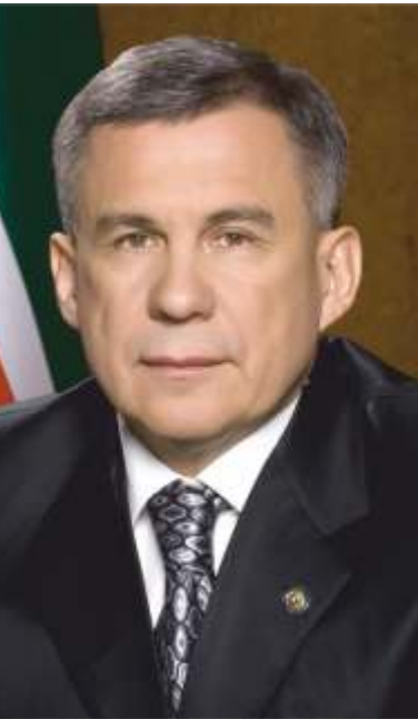
Rustam Minnikhanov President of Tatarstan