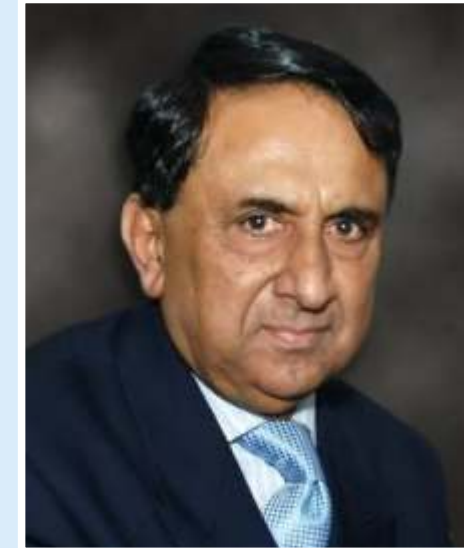
Mohamed Iltaf Sheikh The Lord Sheikh of the House of Lords